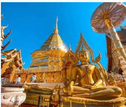
Doi Suthep Temple