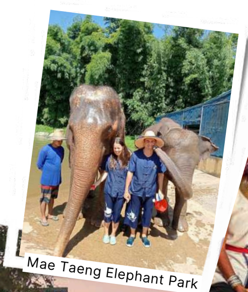
Mae Taeng Elephant Park