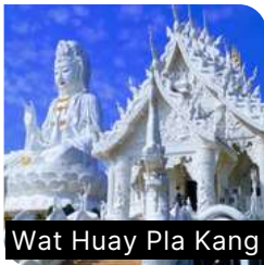
Wat Huay Pla Kang