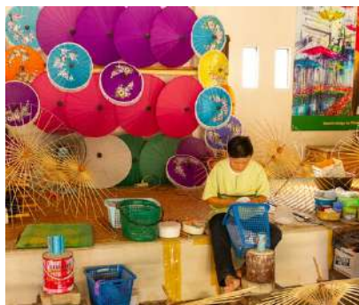
Sankampaeng Handicraft & Bor-Sang Village