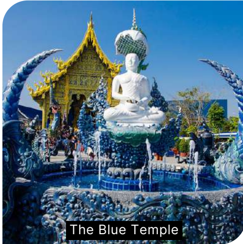
The Blue Temple