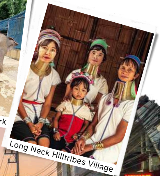
Long Neck Hilltribes Village