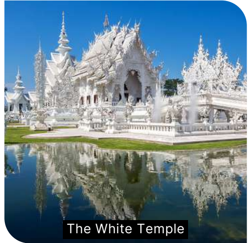
The White Temple